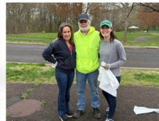
National Volunteer Week