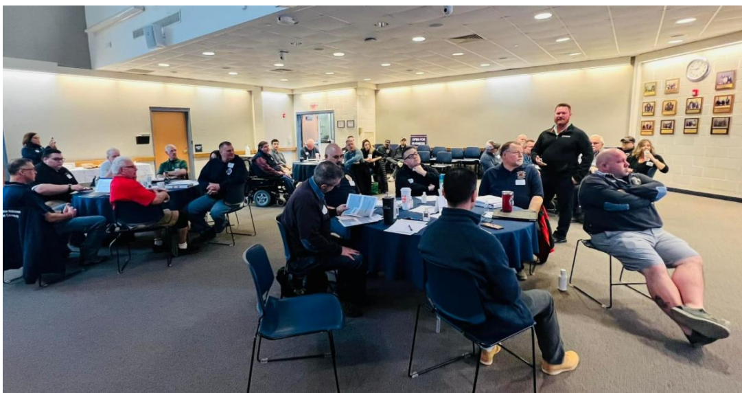
Strategic Planning Session, April 9, 2022

The Board of Supervisors adopted the Fire Services Strategic Plan on Monday, May 16, 2022. Middletown Township re-engaged Dynamix Consulting Group to assist in the development of a Fire Services Strategic Plan that will help improve the community's fire services.