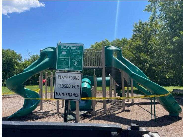
Playground under construction - June 2022

In February, 2022, The Middletown Township Board of Supervisors approved a new playground to replace the well-loved, original playground from 2005. The new playground has many inclusive features: wheelchair access, solitude seats designed for children on the autism spectrum, a music feature, expression swings with adaptive seating for adults and children to sit face-to-face, plus new benches and trash cans.