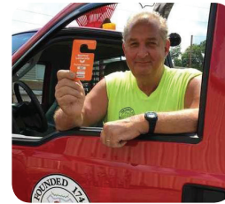
in Berks County