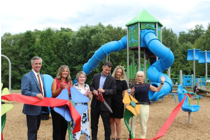
Ribbon Cutting of Cobalt Ridge Playground August 10, 2022